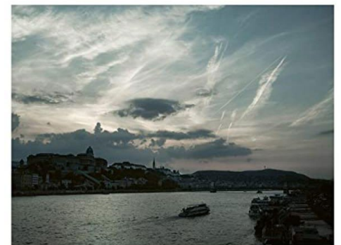
KEITH JARRETT BUDAPEST CONCERT